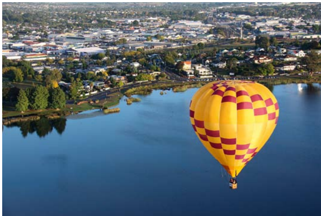
Exemplifying serenity. A peaceful morning flight above Hamilton Lake in the Waikato.

crew undertake a systematic pack-up back into the trailer. With a last check of the landing site to ensure nothing has been left, the crew and passengers leave the landing spot, close any gates as required, and head back to the land owner to thank them for their hospitality and check out