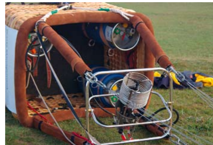
Left: There's a reason the propane tanks are strapped in - Post landing and ready for pack-up of a typical sport balloon. Right: Envelope components include gores (blue), panels (red) and the scoop (orange).