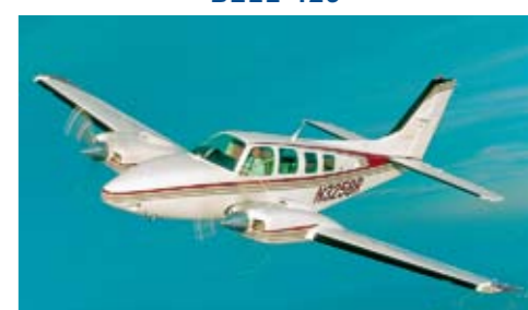
BEECHCRAFT BARON G58