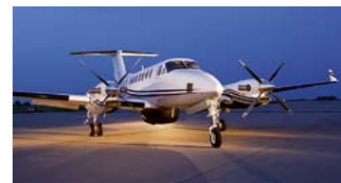
KING AIR 350