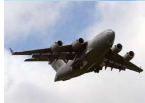
Airshow Picture captions (left column): Harvard waiting to line up as C130-H returns from display; F-A-18A on a full power climb out from a slow pass, then with afterburners at the beginning of its display routine; Red Checkers CT-4E performs a solo display while team members wait in the background; A fast fly-past from the P-51D Mustang. (above column): Formation Iroquois face-off; B737 and C130-H break away from formation flight; Tiger Moth wing walking; C-17A Globemaster during STOL display.