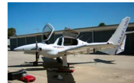
Now at the Australian Air Ferry hangar at California, being kitted for the Pacific crossing.