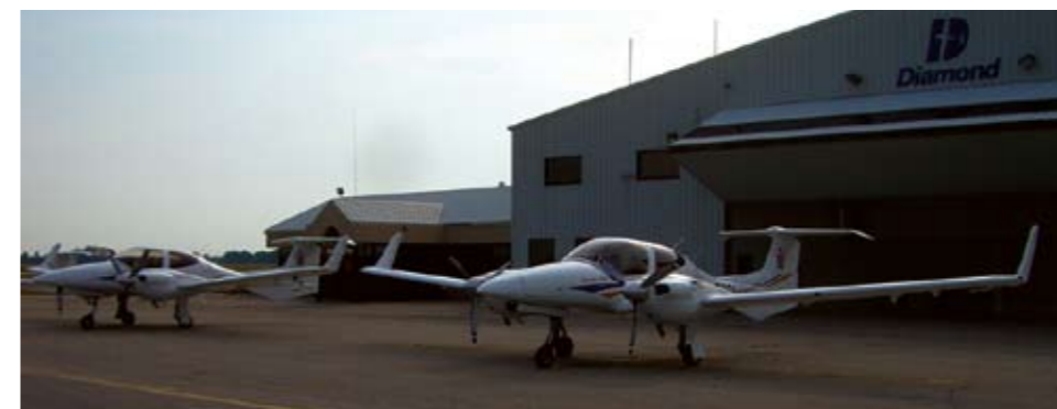
The two DA42's ready to taxi from the Diamond acceptance facility at London, Canada.